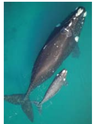
Right Whale mother and calf

As part of the Southern Right Whale Health Monitoring Program, we continue to work with officials and nature experts to try to solve the threats faced by the whales using these bays as their nursery grounds.