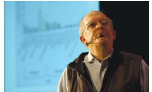
Roger Payne at Future in Review (FiRe®)