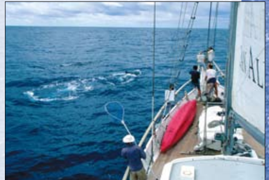
Ocean Alliance crew on task with sperm whales during the Voyage of the Odyssey